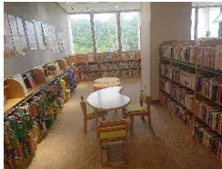
Apply for personalized picture book (Onna Culture & Information Center)

Familiarize a child with books by personalized picture book