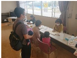
Inform parents at health check-up (Onna Health & Welfare Center)