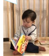
Support book reading activity at home